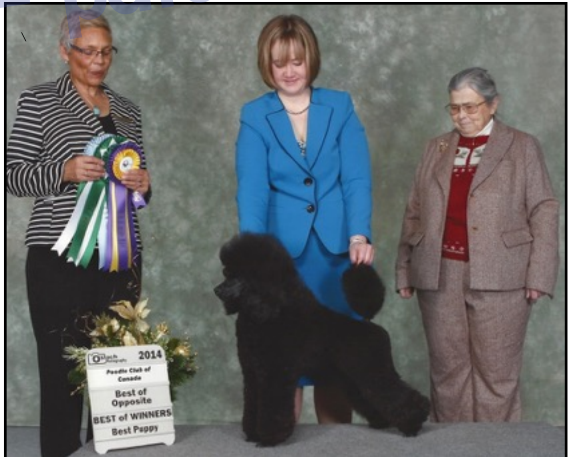
BOS, BW & BP- DIMARNIQUES TIME FOR BELLEFLEET