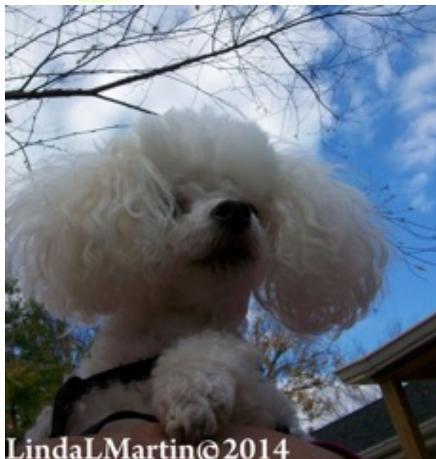
The inspirational Jorji