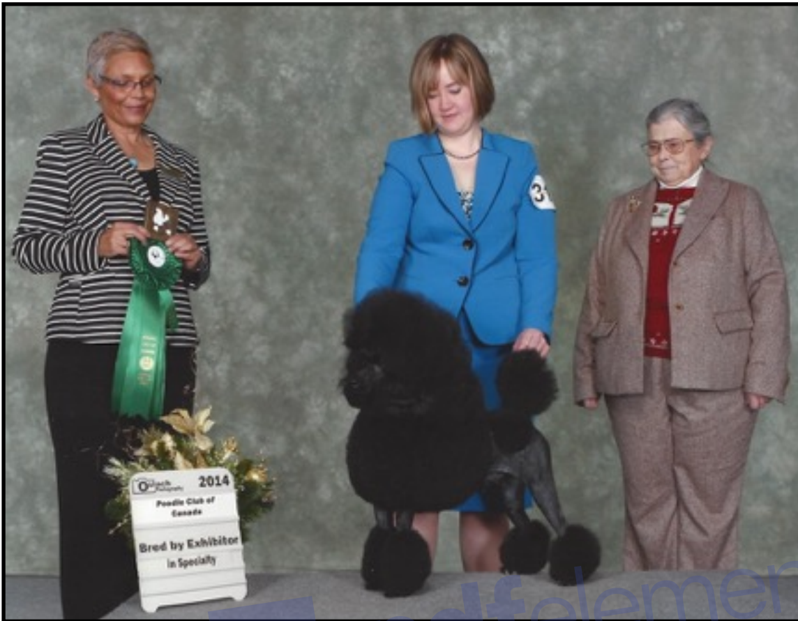
B & BCB- GCH BELLEFLEET'S STEALTH FORCE