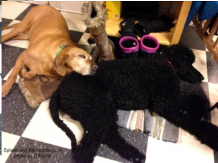
Splash and his roomie Lucy