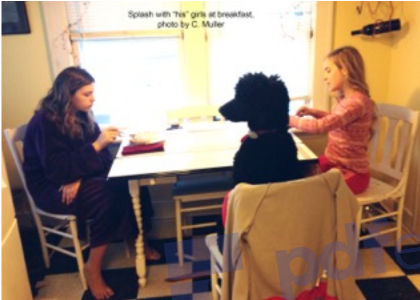
Splash with "his" girls at breakfast

For us it boiled down to genetics, temperament and long-term health as criteria for our selection. What we got is a world-class, amazing, loving, family companion. And looking at everything, a very big bargain.