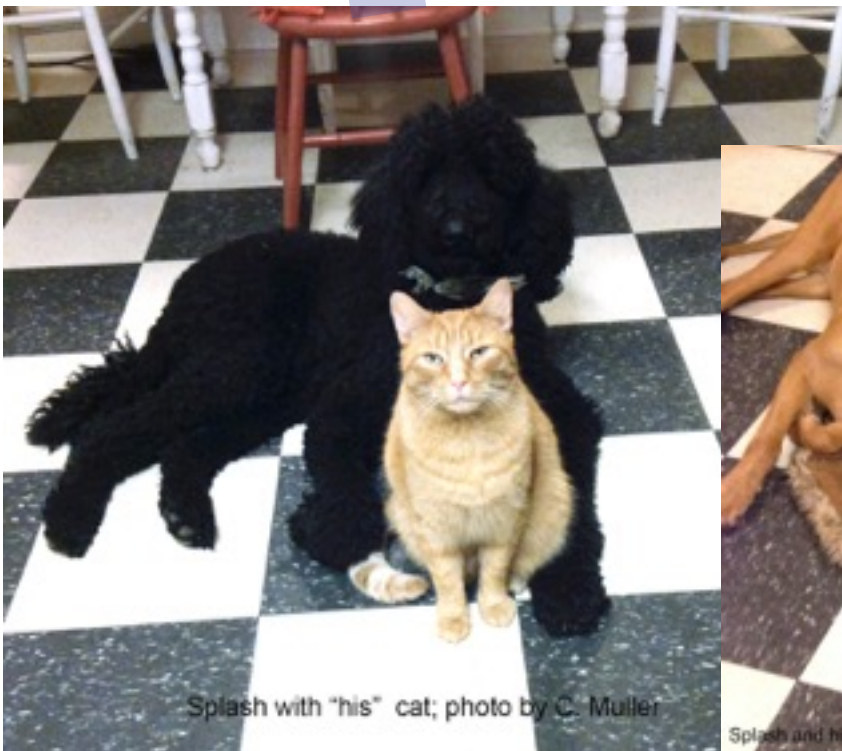
Splash with "his" cat