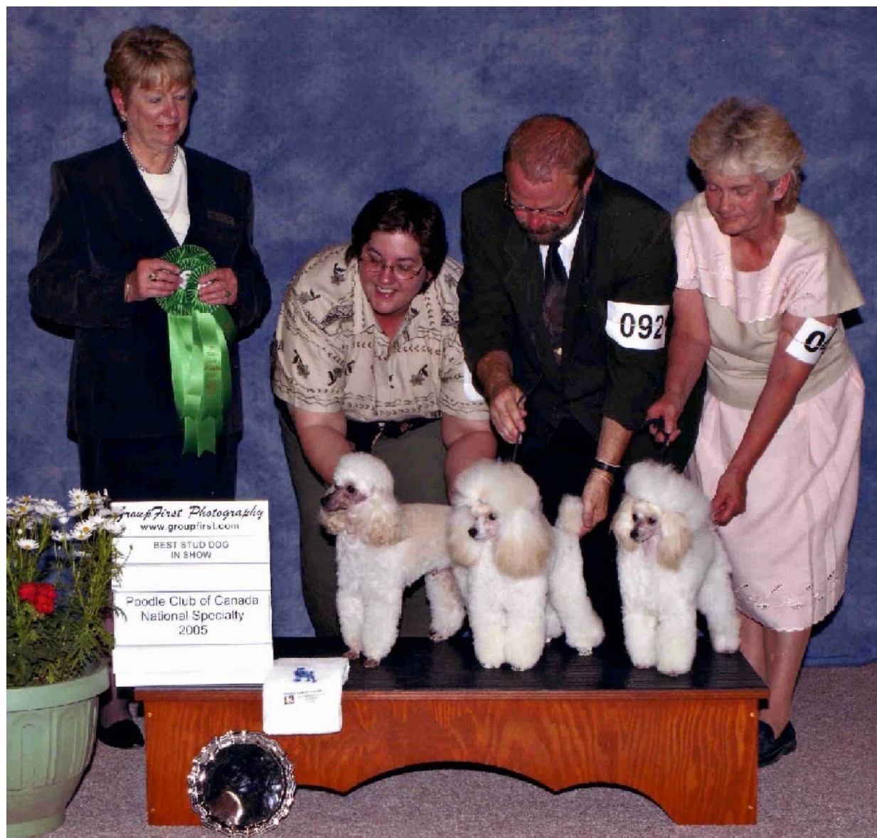
Best Stud Dog in Show at PCC 2005

Cathy Siversns Cavri Reg'd Box 214 Mount Brydges, ON N0L 1W0