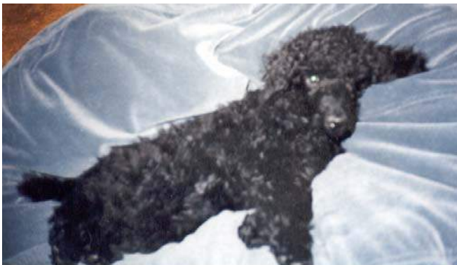
OUR NEW PUPPY